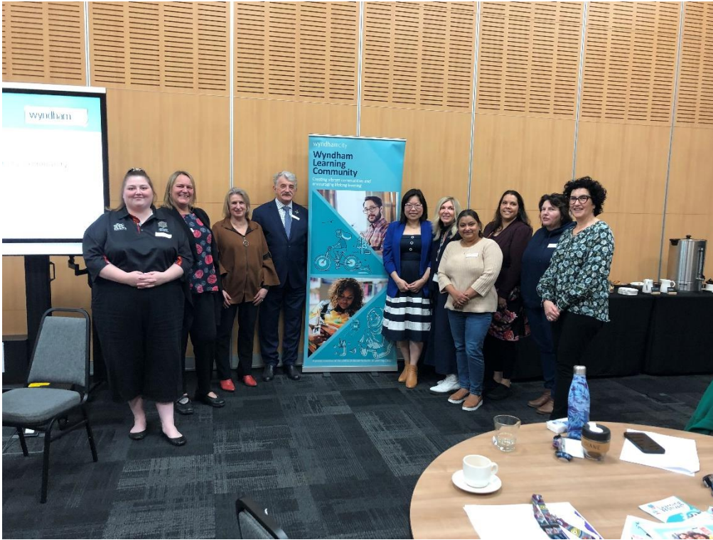
Professionals Network Consultation