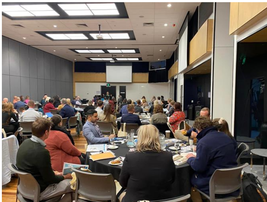
2023 Wyndham Principal's Network Breakfast

Peoples Advisory Panel Learning Community Networks