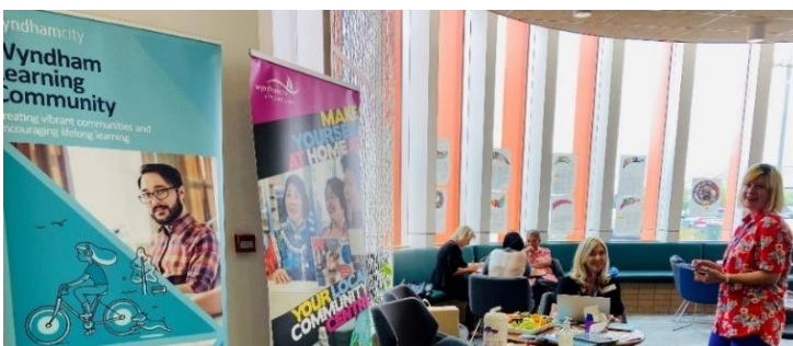
Tarneit Community Learning Centre Community Consultation