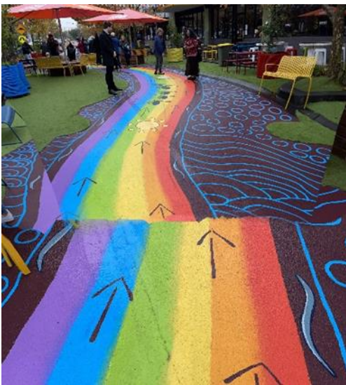
Reconciliation Serpent Mural Launch Point Cook Town Centre