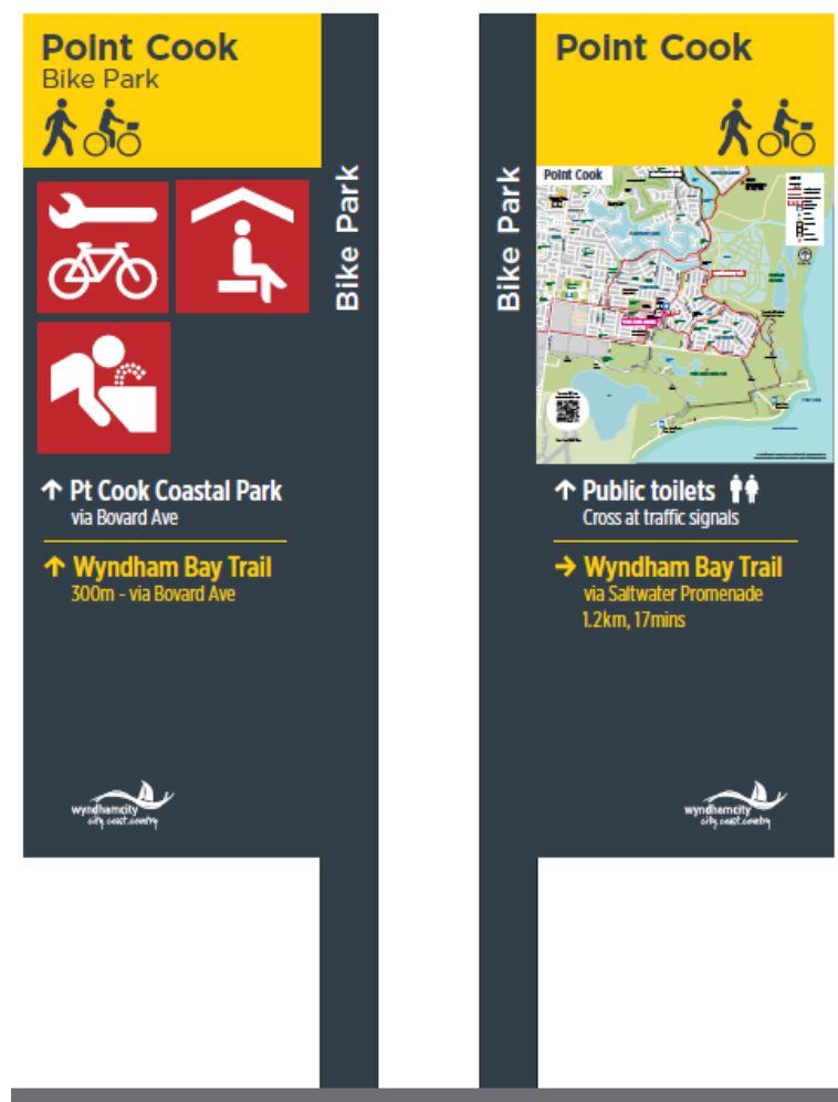
MBS7b Bike Park / Tribeca Village