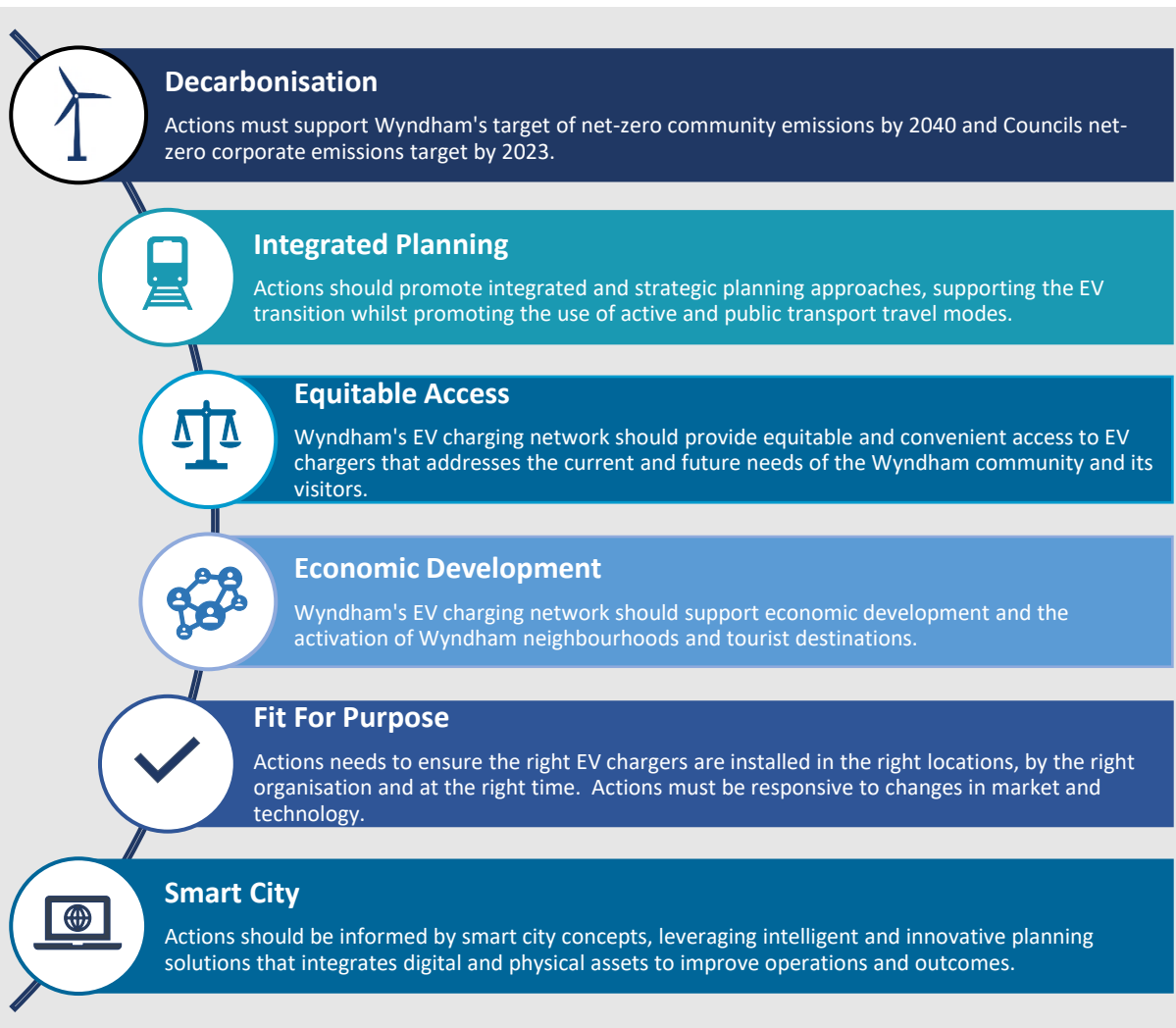
Figure 2: EV Policy Principles