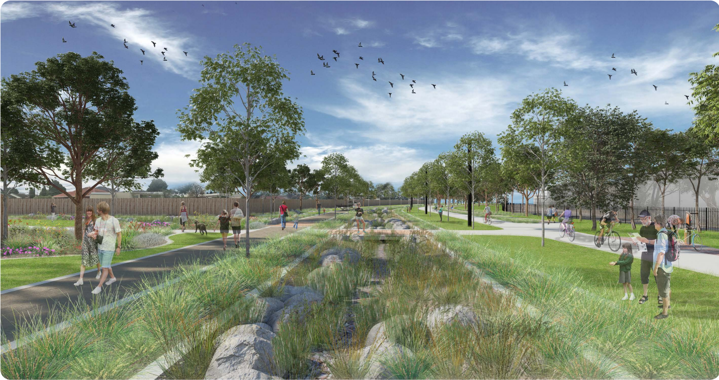
Roya Court Visualisation