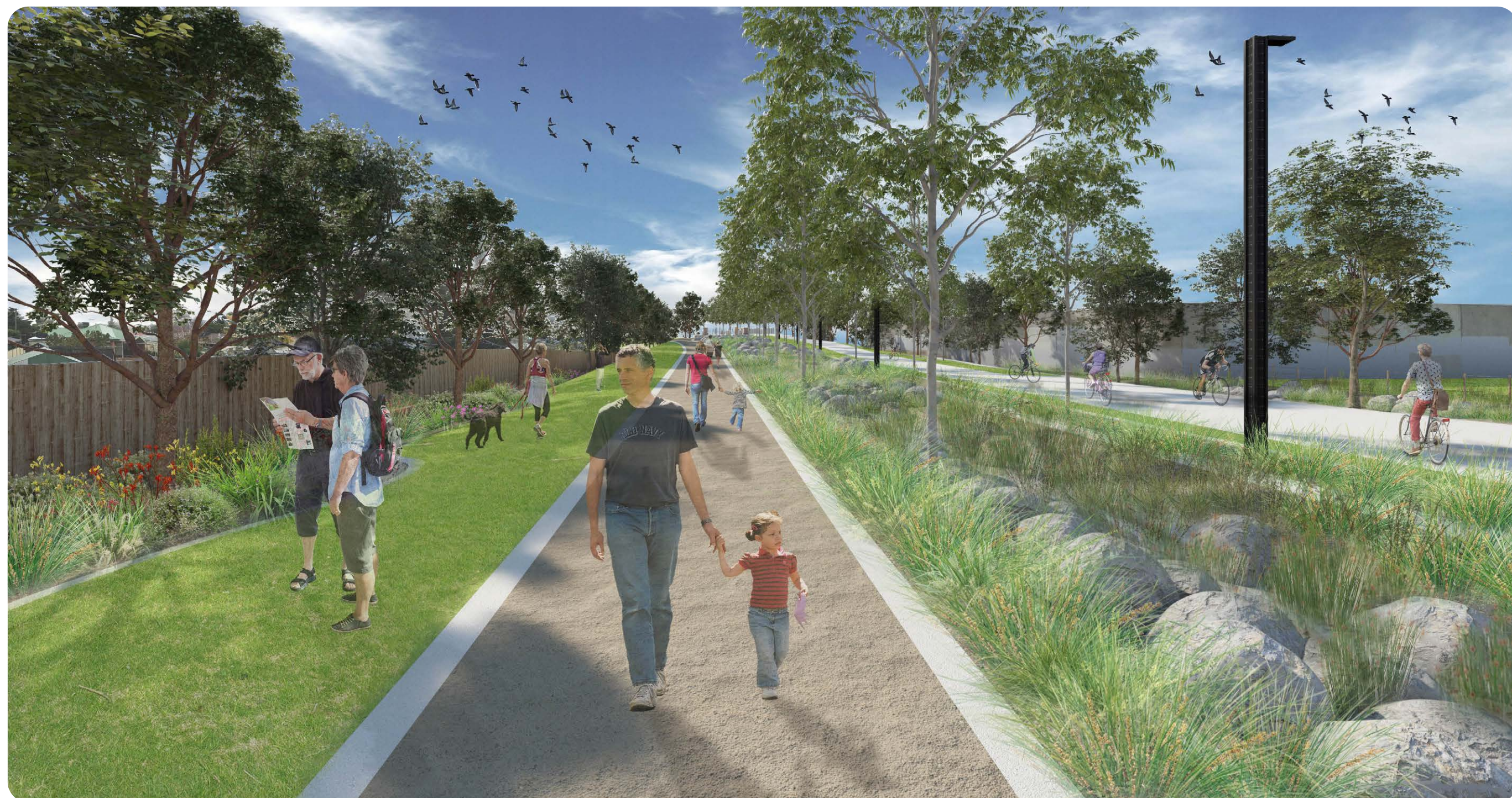
Skeleton Creek Aqueduct Visualisation