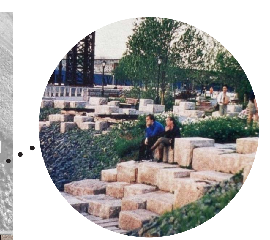
Stone Boulder Garden Bed