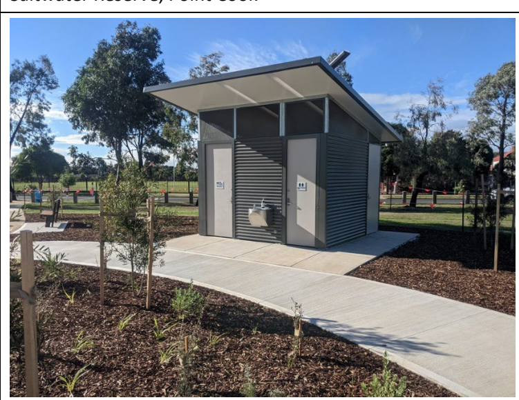
Fraser Street Park, Hoppers Crossing