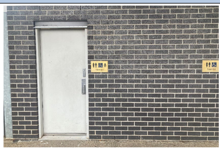
Saltwater Reserve, Point Cook