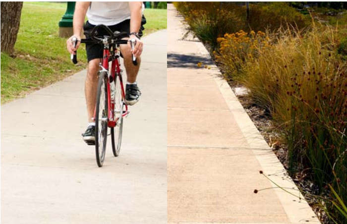
Plain grey concrete paths