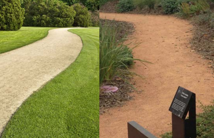
Compacted gravel paths (may be used for formal or informal areas)