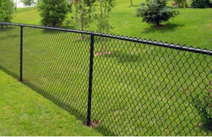
Low black chain mesh fence to soccer fields/junior cricket ovals