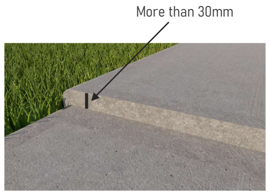
Current intervention level

Consider changing the footpath intervention level from 30mm to 20mm for height differentials to reduce tripping hazards.